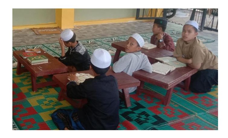
Figure 1: Tahfizhul Qur'an Table Media

Based on the interview information, information was obtained that the Tahfizhul Qur'an media used is the Al-Qur'an, namely the Corner Al-Qur'an and this is the main media, apart from that we also use blackboard media, Al-Qur'an murottals, various the high priest was heard as well as a special small table for memorization. This table is a multi-functional table that is used both when memorizing and when writing.