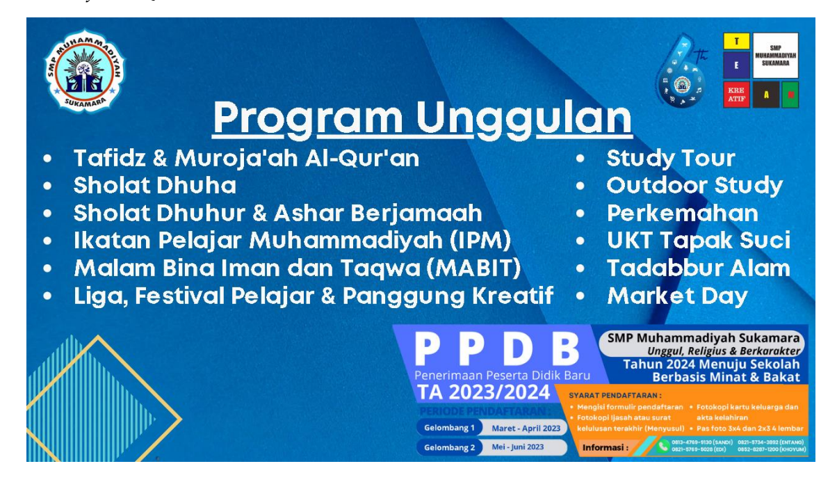
Figure 3. Featured Program of Muhammadiyah Sukamara Junior High School

An effort to improve student learning outcomes through Islamic religious education subjects is through creating a tahfiz program . It is also implemented at Muhammadiyah Sukamara Junior High School by implementing the featured program of tahfiz Al-Quran .