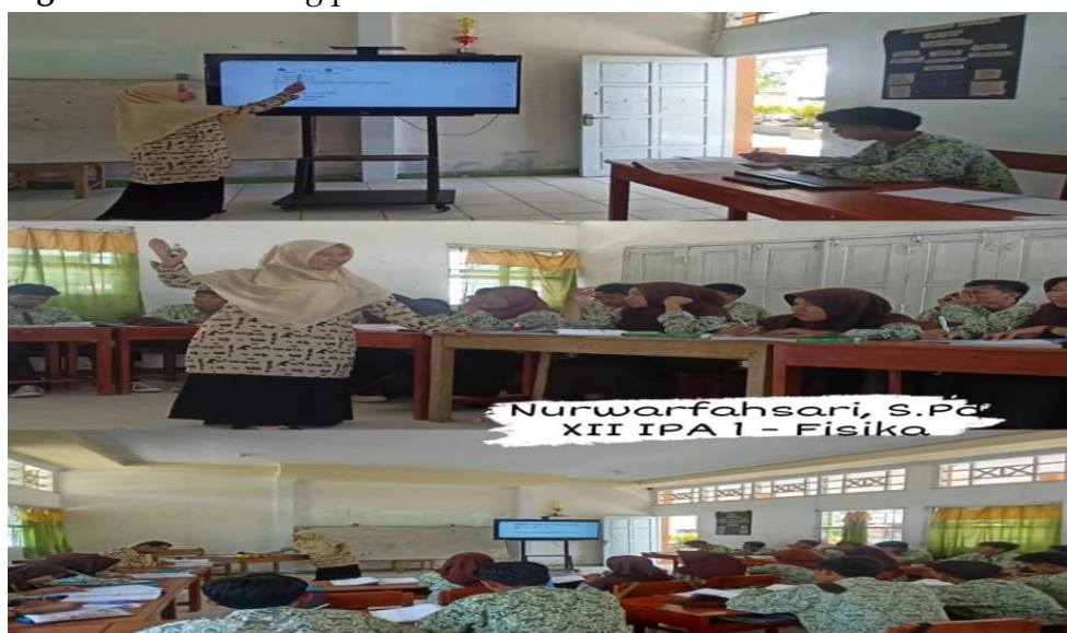
Figure 3. The learning process in class

From this statement and the results of the documentation as well as the observations above, that curriculum development at MAN 4 Bone Regency involves madrasah supervisors. One form of this involvement is supervision which is directly supervised by the madrasa supervisor at MAN 4, Bone Regency. In this case, the supervisor came directly to the madrasa to conduct class visits and observe and assess the learning process at MAN 4, Bone Regency, as shown in the picture above.