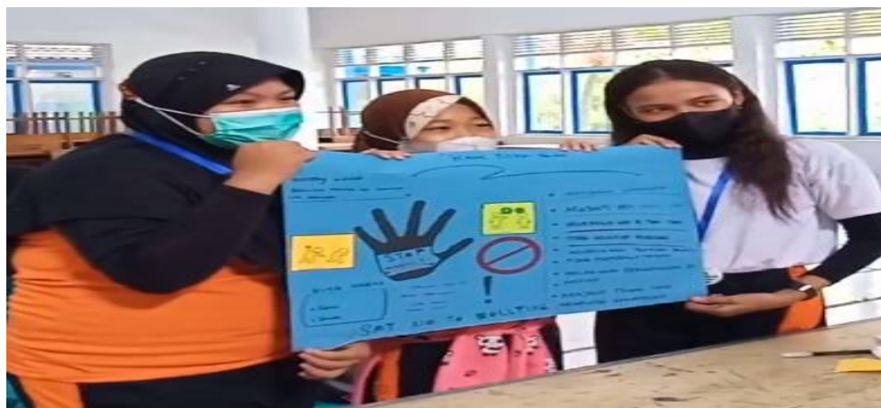
Figure 2. Change Agents create anti-bullying posters