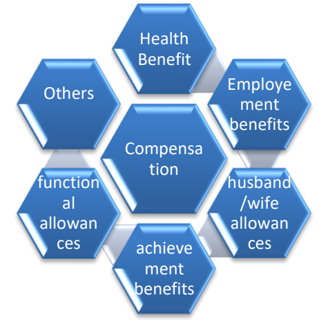
Figure 2 Types of Compensation in Private Universities

Based on primary and secondary data collection, it was found that the compensation data received by permanent lecturers with the lowest group, namely Expert Assistants in the form of gross monthly salaries ranging from Rp. 3,000,000.00 - Rp. 12,000,000.00. In the details of the salary slips obtained by the lecturer, it can be seen that there are details of several benefits attached including health benefits, employment benefits, husband/wife allowances, achievement benefits, functional allowances, structural allowances, in-kind allowances, and others. All lecturers still get a basic salary and allowances. However, among the campuses where the population has a different language in applying for the allowance, some detail it in detail, and some mention it globally. This is by the Decree issued by the respective rectors of the private universities. Thus, permanent lecturers must receive proper compensation in the policies made by the Ministry of Education and Culture in the Regulation of the Minister of Education and Culture Number 84 article 11.