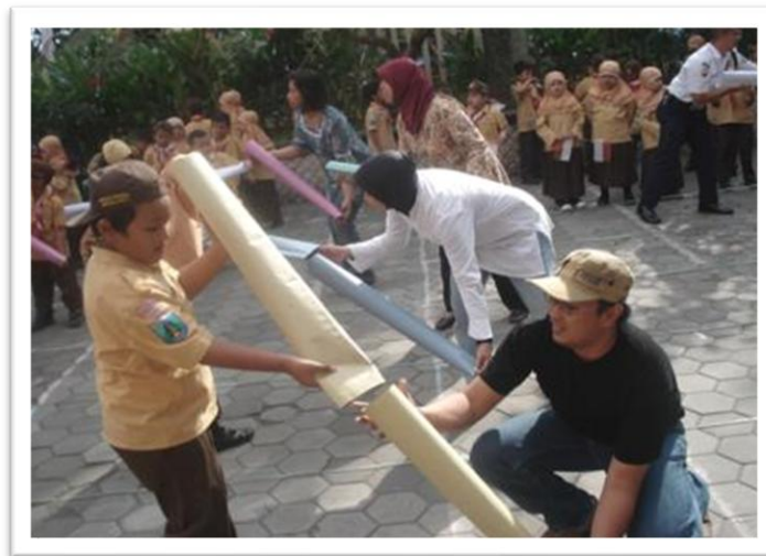
Figure 1: Parental Involvement in Family Gathering Activities at the Madrasah

In addition to this involvement, parents can also play a role in improving the educational standards at the madrasah by participating in family gathering activities. Such activities truly open up opportunities for parents and teachers, especially homeroom teachers, to communicate freely. This is dedicated time for parents to sit together, receive clear updates on their children's progress, and share their thoughts on the Education their children are receiving. Well-established communication between parents and the madrasah can deepen parents' understanding of their children's Education and increase their involvement, which, in turn, can contribute to the academic success of the children. Figure 1 illustrates parental involvement in family gatherings at the madrasah.