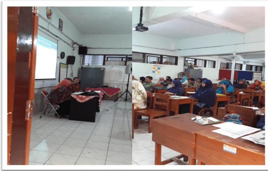
Figure 3. Parental Involvement in Madrasah Program Planning

Based on Figure 3, in this involvement, parents provide valuable ideas and suggestions for planning programs that are more relevant to the needs of students and the surrounding environment of the madrasah. As stated by the Chairman of the Madrasah Council: