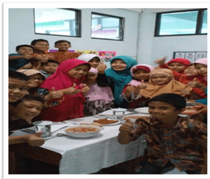
Figure 2: Parental Involvement in Cooking Class Activities

Next, another form of parental involvement in strengthening the quality of Education at the madrasah is through the parenting program, specifically in the cooking class activities, where parents act as resource persons in teaching the children in class (Figure 2).